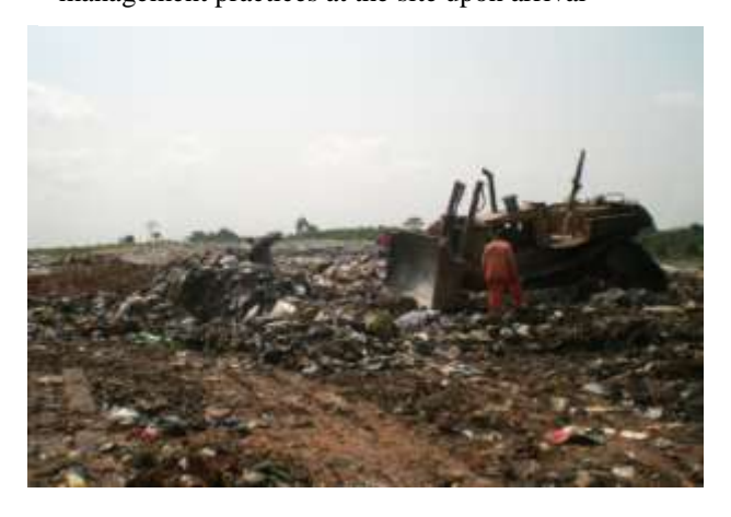
Up-hill view of the landfill with a compactor in site