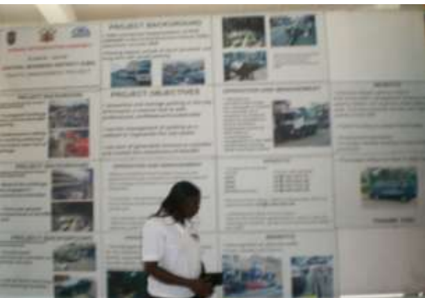
The Zoomlion Gh. Ltd and KMA stands at the Poster Exhibitions