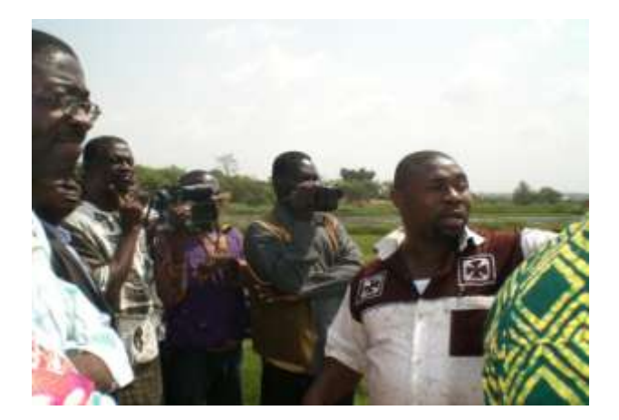
Participants being briefed on the operation at the liquid waste disposal section of the site