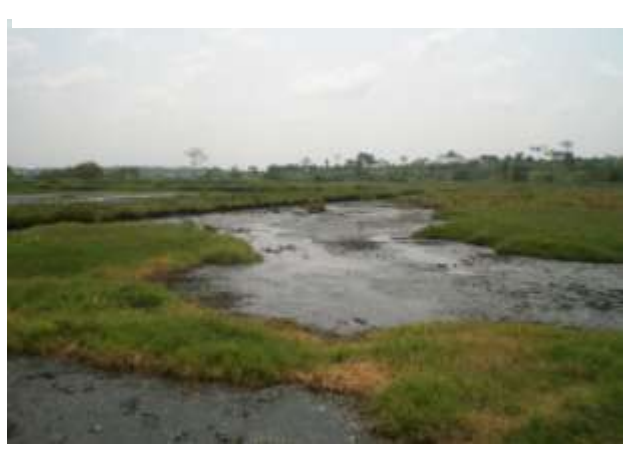
The liquid waste disposal section of landfill site